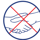
Greet without shaking hands and do not embrace others