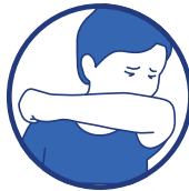
Cough or sneeze into your elbow or a tissue