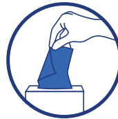
Blow your nose on a disposable tissue and throw it away