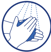
Wash your hands regularly or use hydro-alcoholic gel