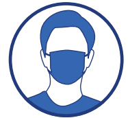
Wear a mask when it is not possible to respect one-metre distancing and in all places where it is compulsory