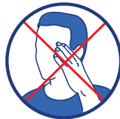
Avoid touching your face